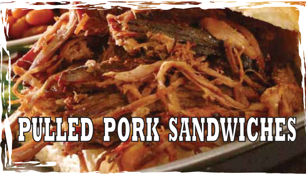
PULLED PORK SANDWICHES