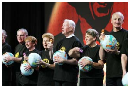
Images from the Rotary International website. Photos by Monika Lozinska-Lee