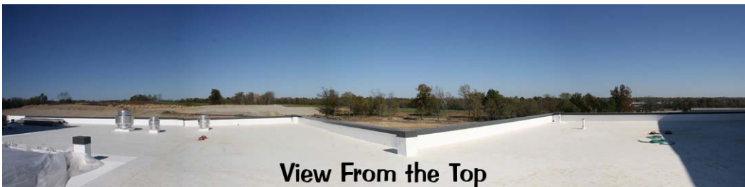
View From the Top