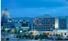
Capital Plaza Hotel Jefferson City, MO.