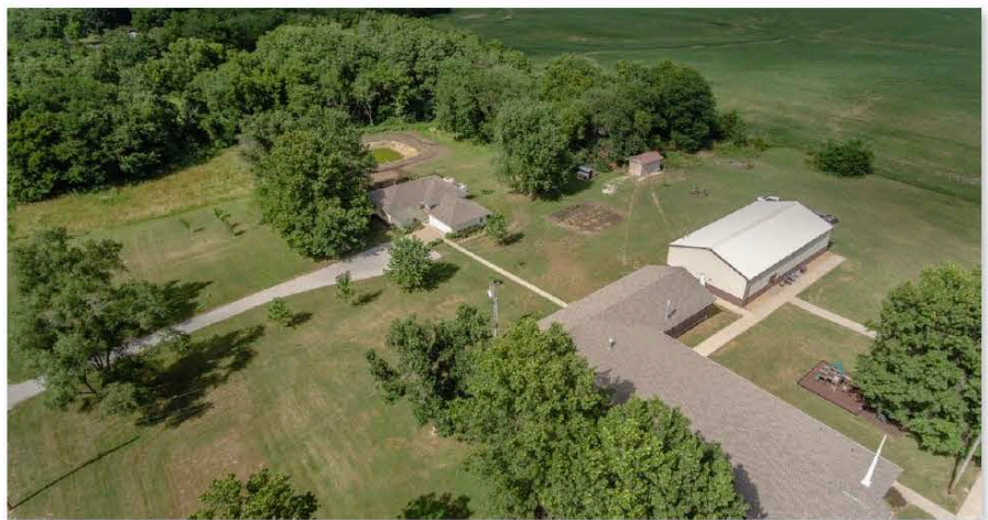
The seven-acre site of Restoration House - The Farm is the former First Baptist Church of East Lynne, just north of Highway 2. In addition to providing services for adult victims of human trafficking, it serves as the headquarters for Restoration House KC.